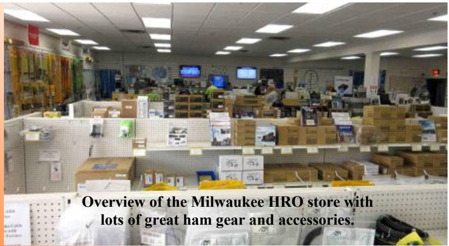
Overview of the Milwaukee HRO store with lots of great ham gear and accessories.

I arrived a little early to take these shots . One can tell by the few hams initially in attendance. As the afternoon progressed, the pace filled up with quite a number of hams drooling over the new goodies being offered.