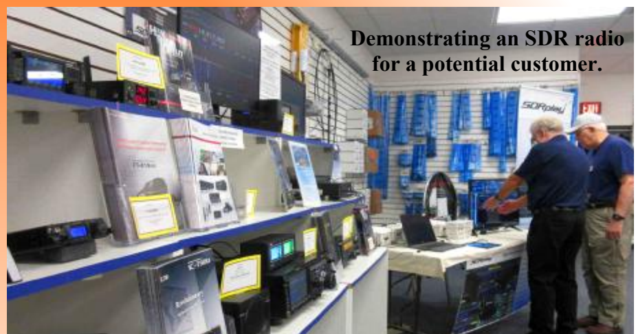
Demonstrating an SDR radio for a potential customer.