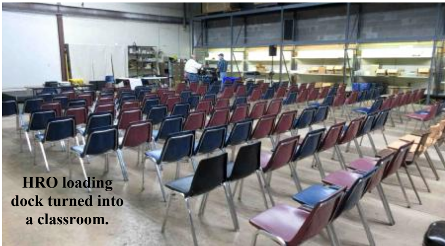
HRO loading dock turned into a classroom.

I arrived a little early to take these shots . One can tell by the few hams initially in attendance. As the afternoon progressed, the pace filled up with quite a number of hams drooling over the new goodies being offered.