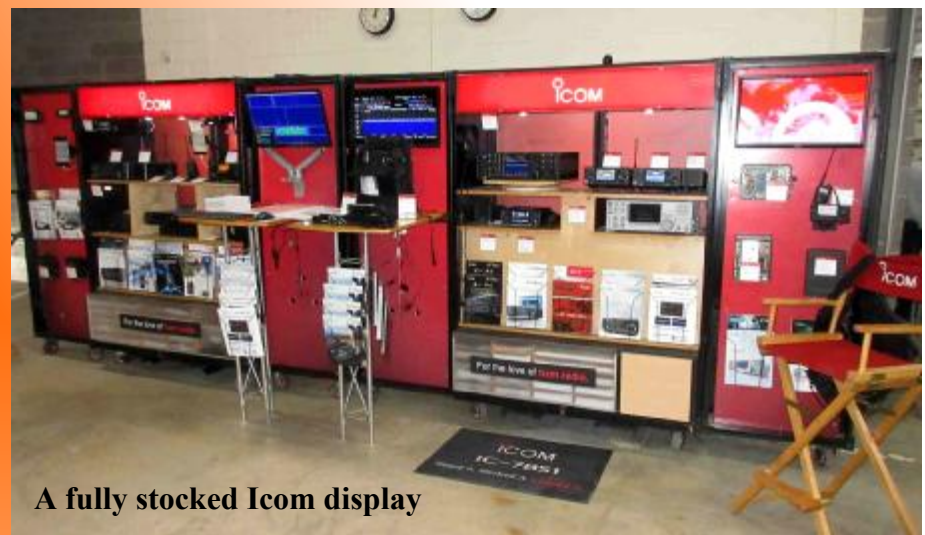
A fully stocked Icom display

I can safely say that prices of the new equipment have skyrocketed and I feel sorry for new hams entering the field. It will cost them a pretty penny to get new equipment, and set up their stations.