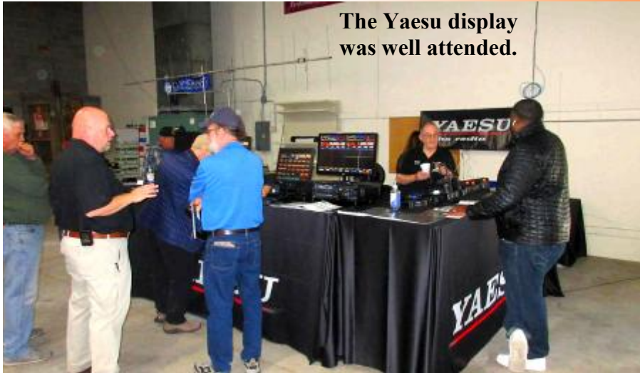
The Yaesu display was well attended.

I can safely say that prices of the new equipment have skyrocketed and I feel sorry for new hams entering the field. It will cost them a pretty penny to get new equipment, and set up their stations.