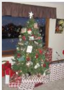
plate. Michael set up the big living room TV so my grandsons in Florida and in Wisconsin