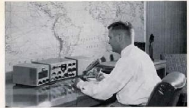
OR 'CASTLE' WITH A KWM-1