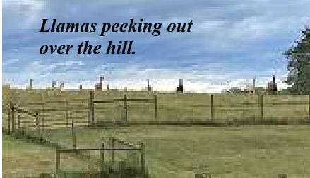
Llamas peeking out over the hill.