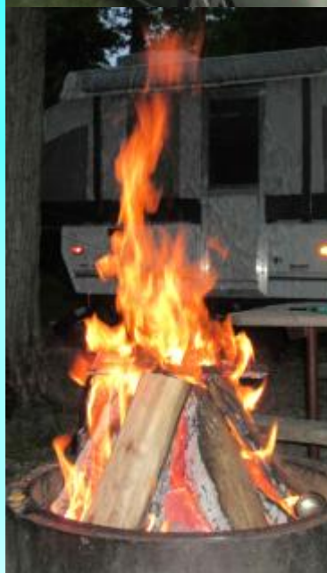
Back at the KOA Campground, a few of us gathered around our nightly campfire. This ended a perfect day, resting our feet after a long trek through the Hamfest.