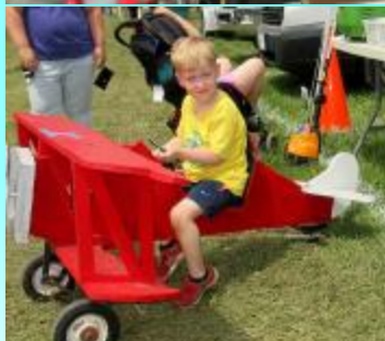
This little guy shows off his new wooden "Red Baron" aero plane, sold to his dad from the crew at the 68 group booth.