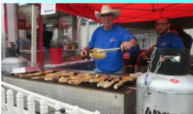
Somehow I keep coming back to the pork chops.. MMMMMMMMMMM