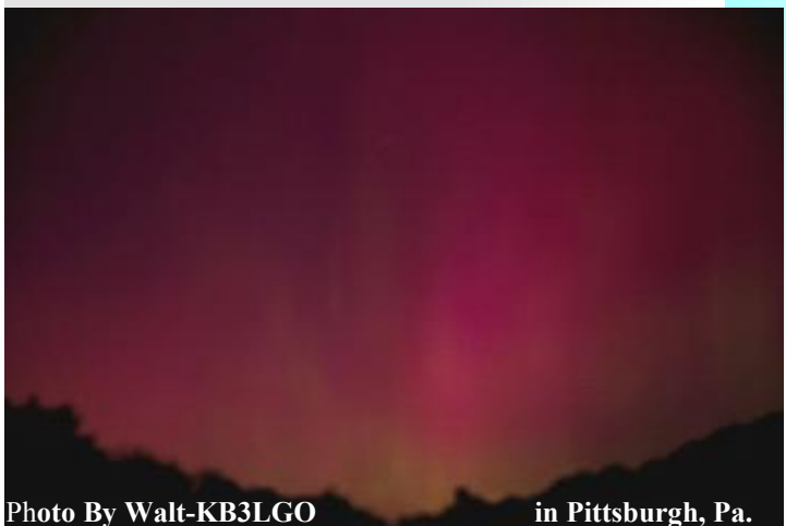
in Pittsburgh, Pa.