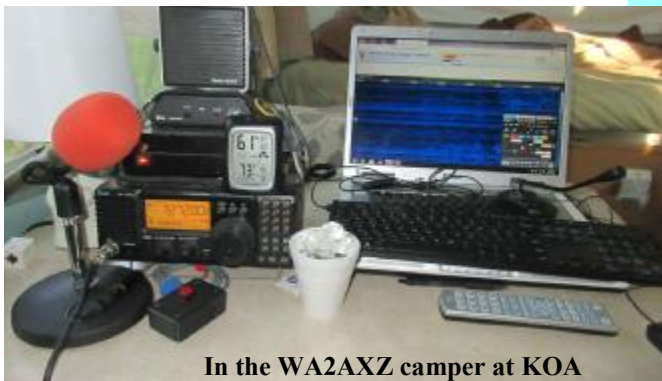
In the WA2AXZ camper at KOA