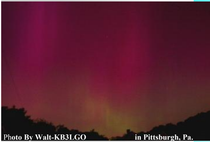
in Pittsburgh, Pa.