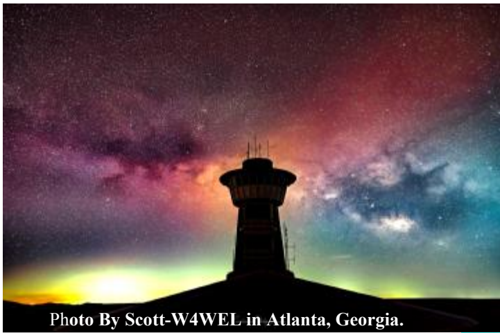
in Atlanta, Georgia.