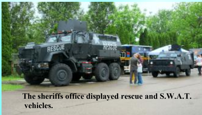
The sheriffs office displayed rescue and S.W.A.T. vehicles.