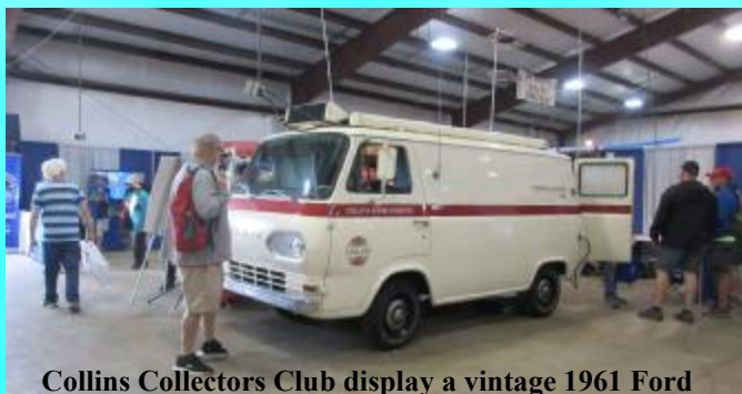
Collins Collectors Club display a vintage 1961 Ford van, fully equipped with Collins gear.