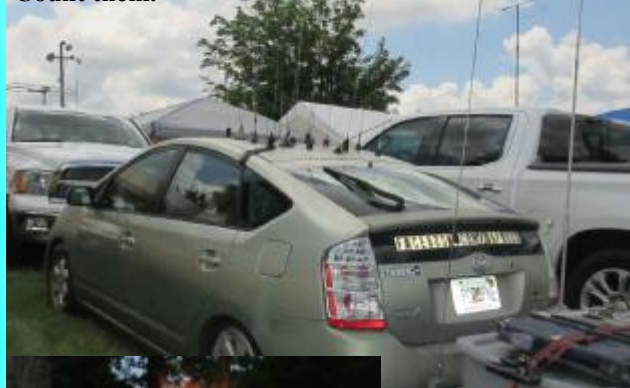
Are there enough antennas on this car? Count them!