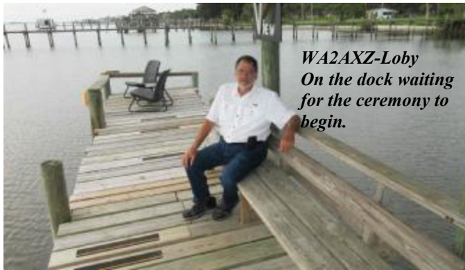
WA2AXZ-Loby On the dock waiting for the ceremony to begin.