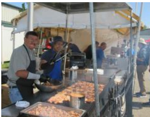
Bourbon Chicken for lunch. MMMMM

All hams walked their legs off in the fairgrounds, and needed a rest anywhere they could get it! (hihi)