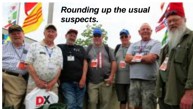
Rounding up the usual suspects.