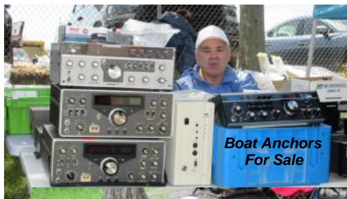
Boat Anchors For Sale

Loby's New-Old Microphone and Train Signal?