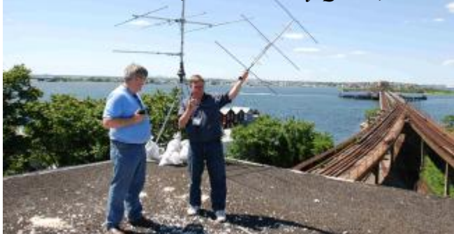
Loby's K2IRT crew doing satellite contacts on the roof of the Hammels-Wye Substation, on Jamaica Bay-Queens, NY.

If you have any stories or photos of your Field Day activities, send them into the Chew for upcoming publications of the Chew!