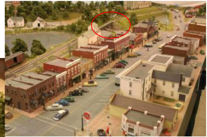
THIS IS A VIEW SHOWING THE "ARCH"