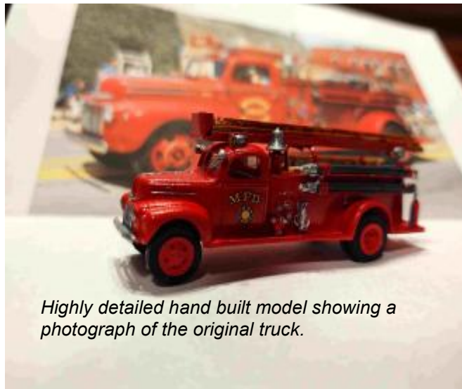
Highly detailed hand built model showing a photograph of the original truck.

RECENTLY HE FINISHED UP A FEW DETAILS, AND WHAT MARVELOUS DETAILS, FOR AN HO LAYOUT FOR FRIENDS IN MICHIGAN, MODELED AFTER LARRY'S 1950'S HOMETOWN OF MILFORD, MI.