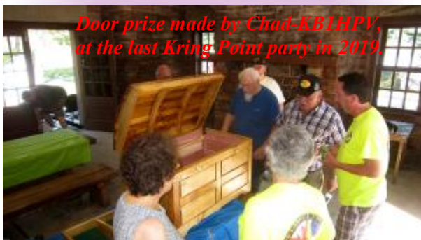
Door prize made by Chad-KB1HPV, at the last Kring Point party in 2019.

Everyone is welcome to stop by the Kring Point State Park pavilion, enjoy a hot dog or two, and chat with good friends across the picnic table with no QRM-QRN allowed. If you wish further information, please contact Loby-WA2AXZ at wa2axz@arrl.net or call: 347-583-3612