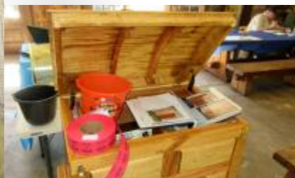
Food, Wonderful Food!

to handle the 50/50 prize tickets, the door prizes and a special raffle for the magnificent chest Chad-KB1HPV made for the gathering.